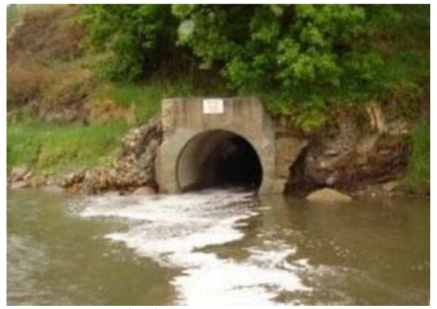
Terra Erosion Control, Ltd.

To Report an Illicit Discharge, Please Call Code Enforcement: (772) 388-4436 For Answers to Questions or Concerns about Storm Water, Please Call the Citizen Request Line: